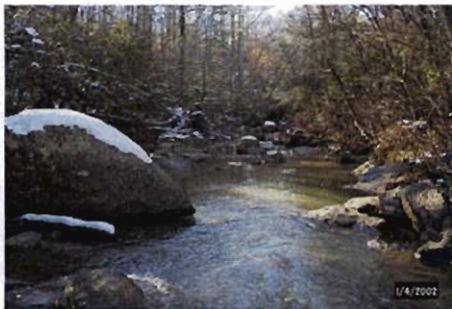
Cleaner streams provide a benefit to all.

The series is produced by the ALOA Storm Water Advisory Panel and is intended to protect, maintain, and restore the chemical, physical, and biological integrity of local waters in order to enhance the quality of life for our citizens.