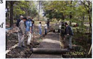
Auburn University Arboretum

Studies have shown that pervious pavement is an effective solution at removing suspended solids (80-95% removal), nutrients (70-85% removal) and metals (98% removal). Pervious pavements are ideal for driveways, walkways and parking lots but may not be effective in high traffic areas.